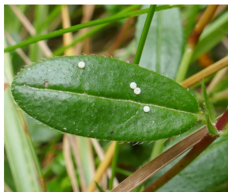
Eggs on Common Rock-rose - Hilary Swift